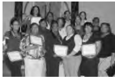
Pharmacy Techs are poised for success!