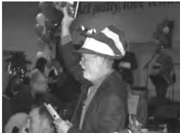
A lucky Green Food and Bands door prize winner.

expand its services in the commercial market as well as private. Recent jobs include the seat cushions for children at Baltimore's National Aquarium , chairs for the Dogwood Café in Hampden, and furnishings for the France-Merrick Foundation . Thanks to all who use our services and help spread the word!