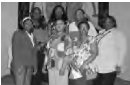
Childcare graduates look forward to their new careers.