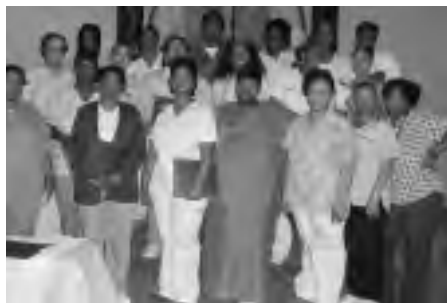
Newly certified nursing assistants are ready for the workforce.

Congratulations to the 49 women of Class 36 who graduated on April 5. On graduation day already 15 of the women had job offers in nursing homes, daycare centers, commercial kitchens and pharmacies. Our graduates continue to make us proud!