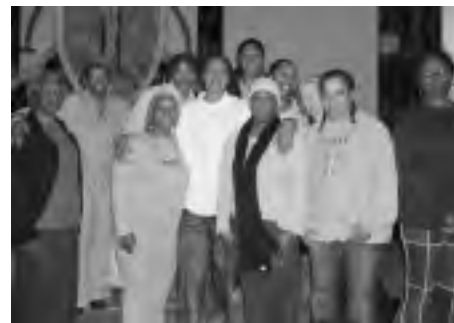
Caroline Center Upholstery welcomes a new member.

Baltimore, Maryland 21202 900 Somerset Street CAROLINE CENTER